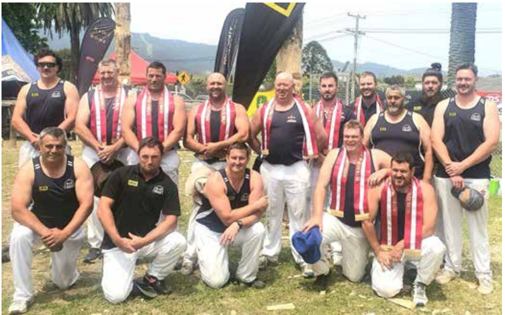
Nelson Show, New Zealand – The winning NSW Team pictured with the New Zealand South Island team.

Phone: 0434 008 874 or Email: midwestaxemen@outlook.com