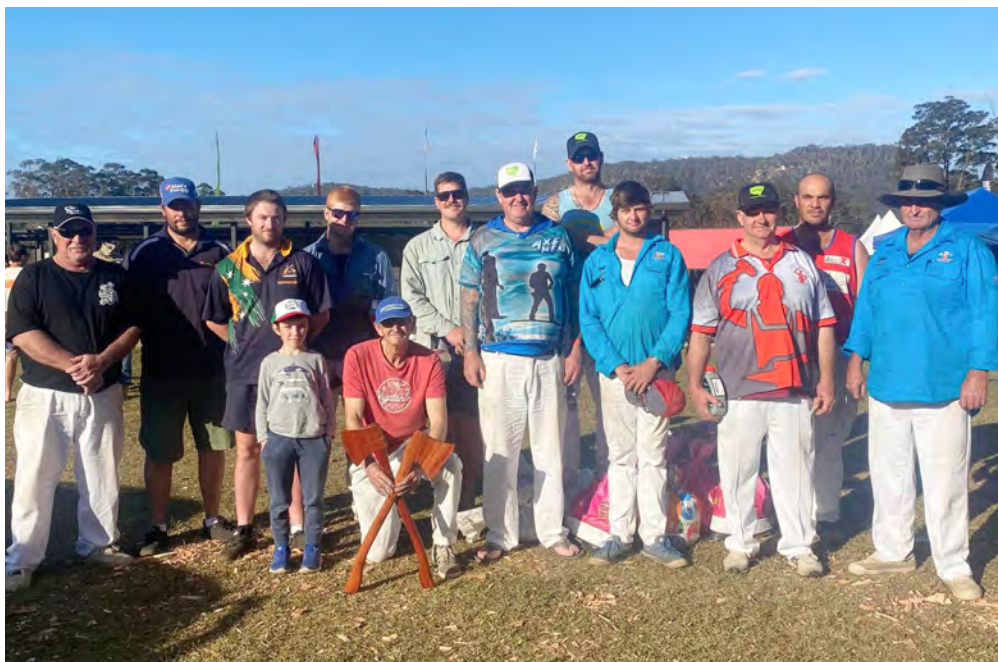
2022 Glenreagh Woodchop – Another successful day's chopping on the North Coast at this annual event.

All Competitors must provide their own safety equipment for the event. Woodchopping Chain-mail Socks must be worn. Stocksaw Chaps, glasses and hearing protection must be worn.